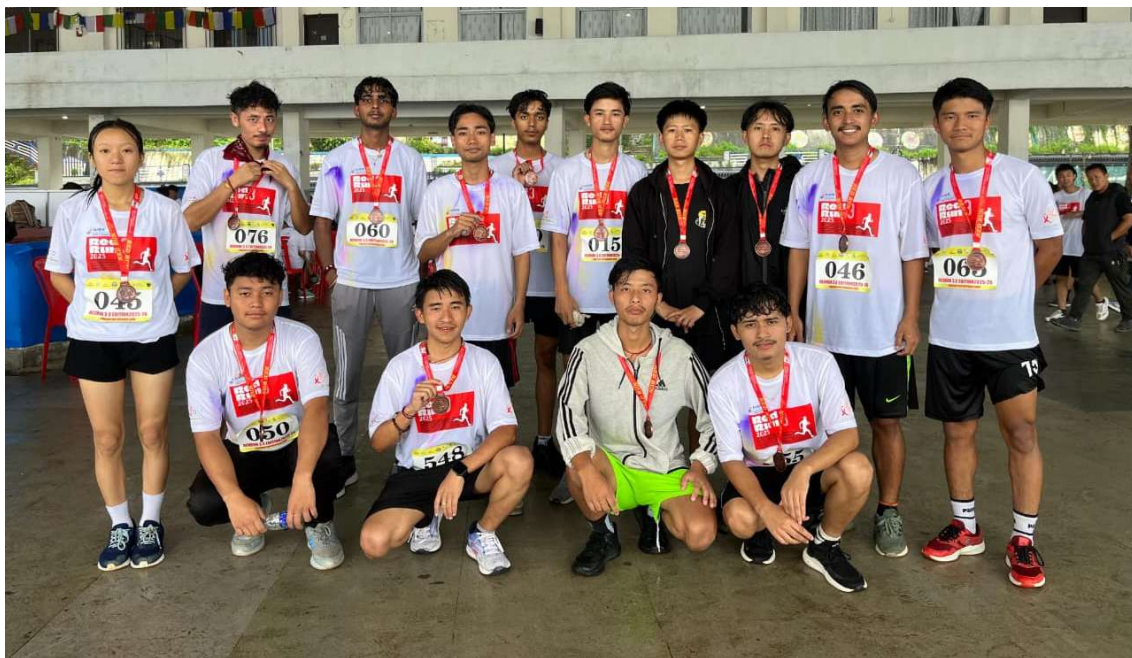
Photo 2: After completing the marathon, students with completion medals