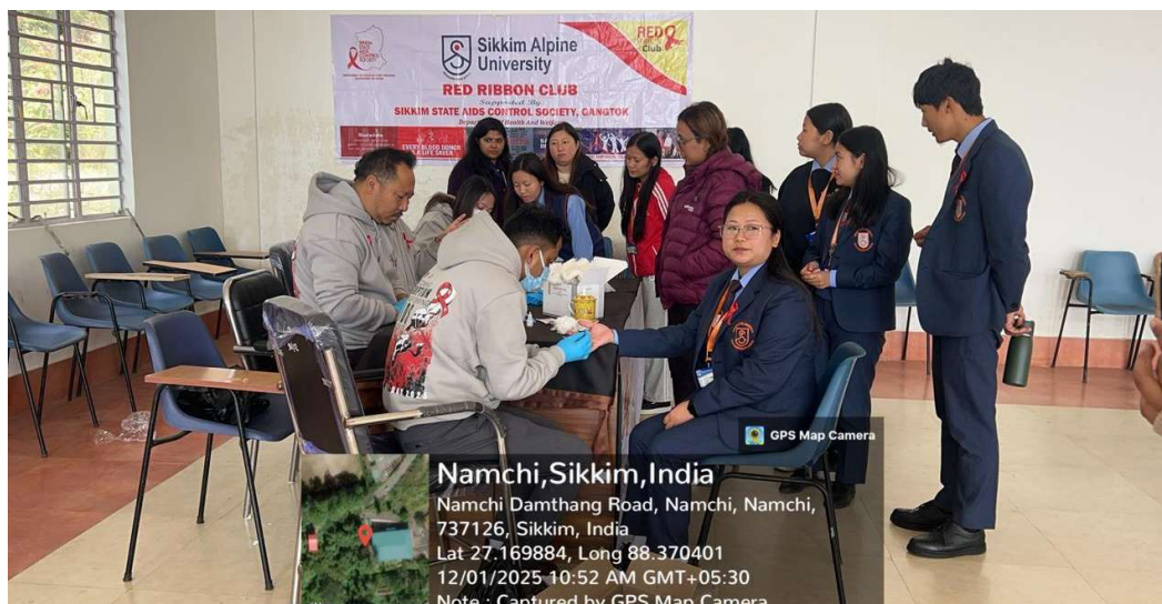
Photo 2: Students checking their HIV status in the HIV Testing Booth at SAU campus set up by team of SSACS, Namchi District Hospital.