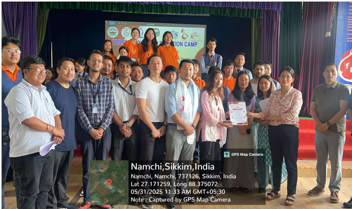
Photo 1: Blood donors from Sikkim Alpine University (Faculty and students)