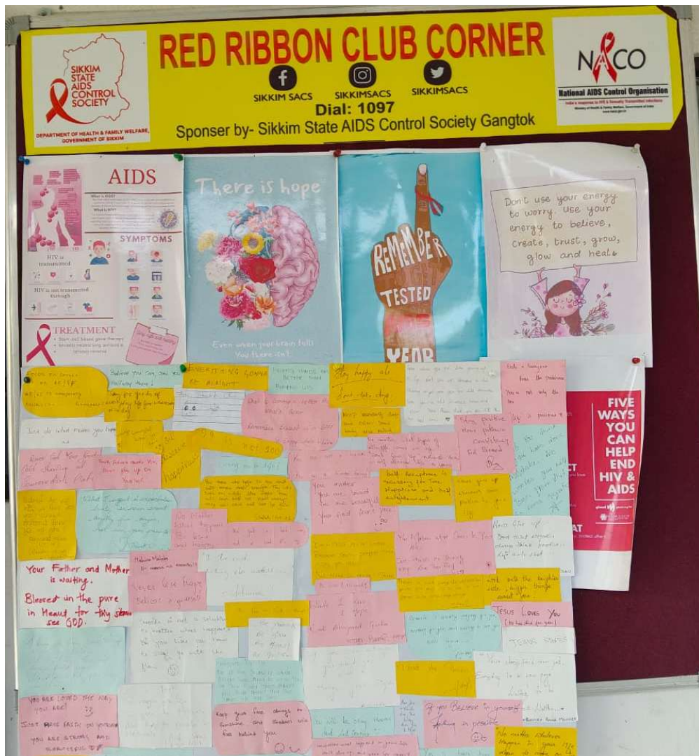
Photo 5: Wall of Hope in SAU Campus, made by the participants with each motivational quotes