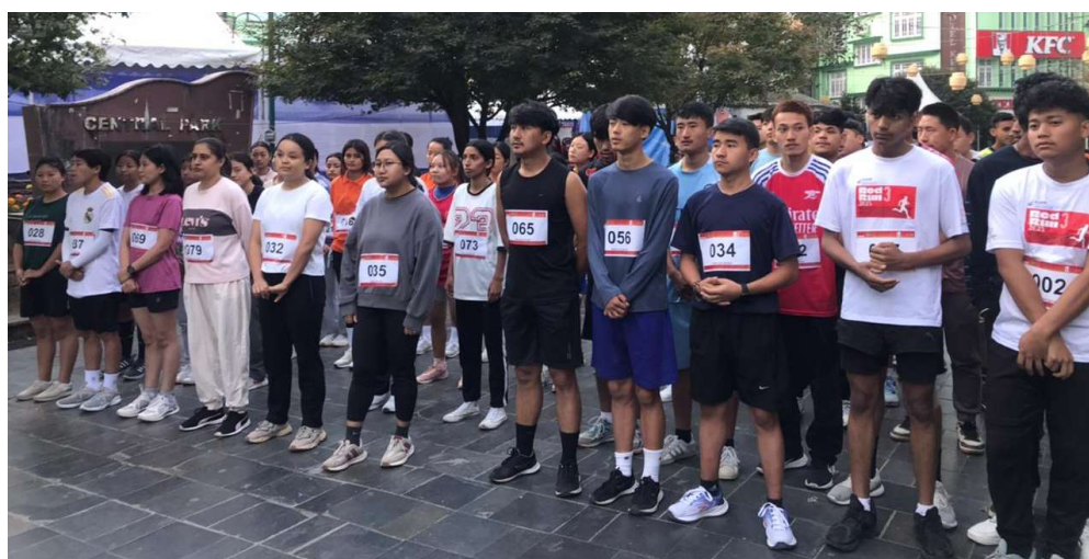
Photo 3: Marathon participants including students and faculties from Sikkim Alpine University and from localities.