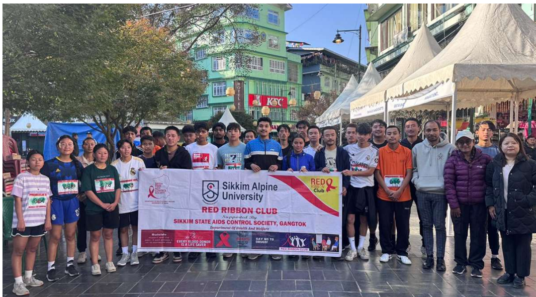
Photo 1: Marathon participants from SAU and locals along with SSACS team, Namchi District Hospital, Government of Sikkim.