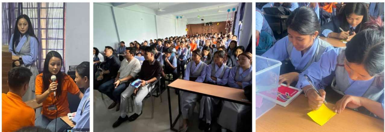
Photo 4: Students performing skits and participating in interactive sessions.