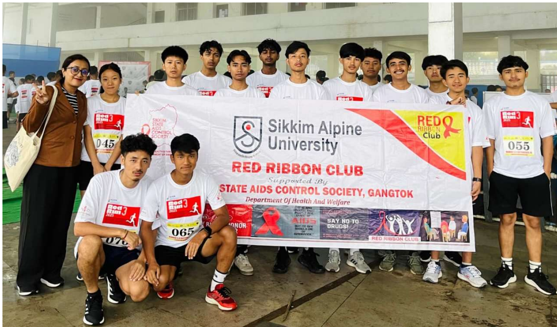
Photo 1: Before the commencement of marathon, SAU student participants with the Nodal Teacher, RRC, SAU